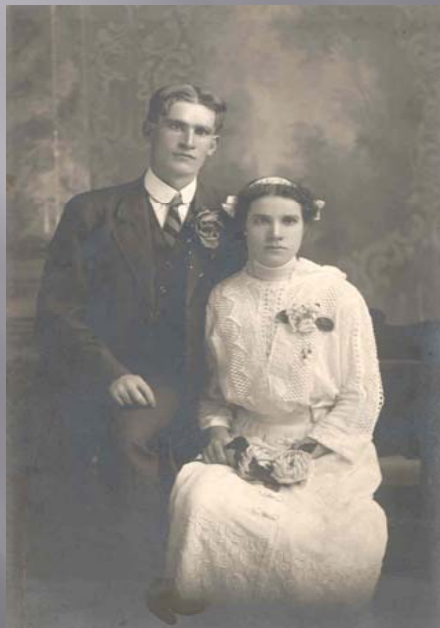
My grandparents, 1911

New immigrants to southwest Saskatchewan via the US (grandmother) and Russia (grandfather)