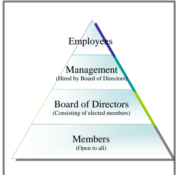
Figure 1: Organizational Structure of Co-operatives

Co-operatives are democratically controlled, with each member having one vote. There are no majority owners or owners who have a greater